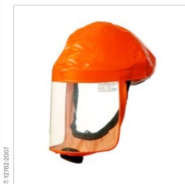
Dräger X-plore® short hood TH2, orange