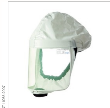
Dräger X-plore® short hood TH2, grey