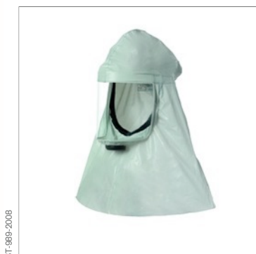
Dräger X-plore® long hood TH2, grey