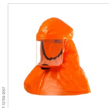
Dräger X-plore® long hood TH2, orange