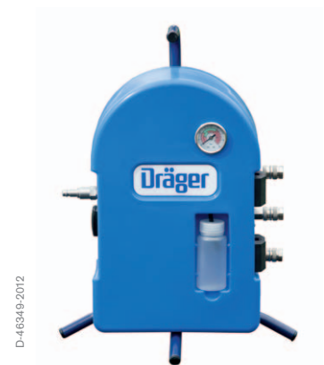
Dräger PAS® Filter - portable