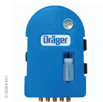
Dräger PAS® Filter - wall-mounted